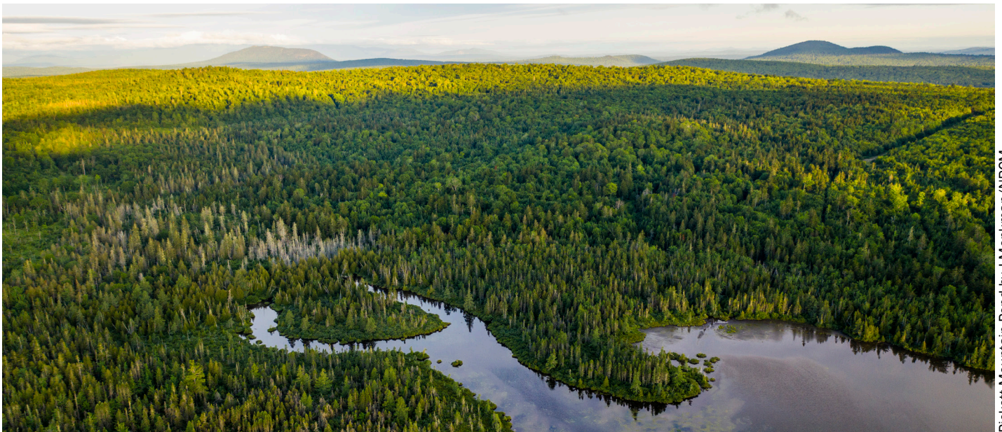
Pickett Mountain Pond