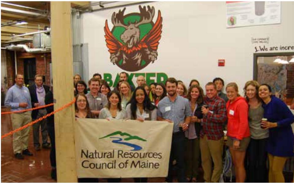
A special NRCM Rising meet-and-greet at Baxter Brewing in Lewiston.

In the age of social media and engaging the power of networks, NRCM Rising is focused first and foremost on identifying and connecting like-minded young professionals statewide. We've hosted many gatherings, including in Belfast, Bangor, Hallowell, Portland, Freeport, and Lewiston. We maintain a presence on Facebook and Instagram, and share information through our e-newsletter. The NRCM Rising network currently consists of more than 1,000 people from the Katahdin region to Kittery.