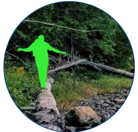
You! JOIN US!