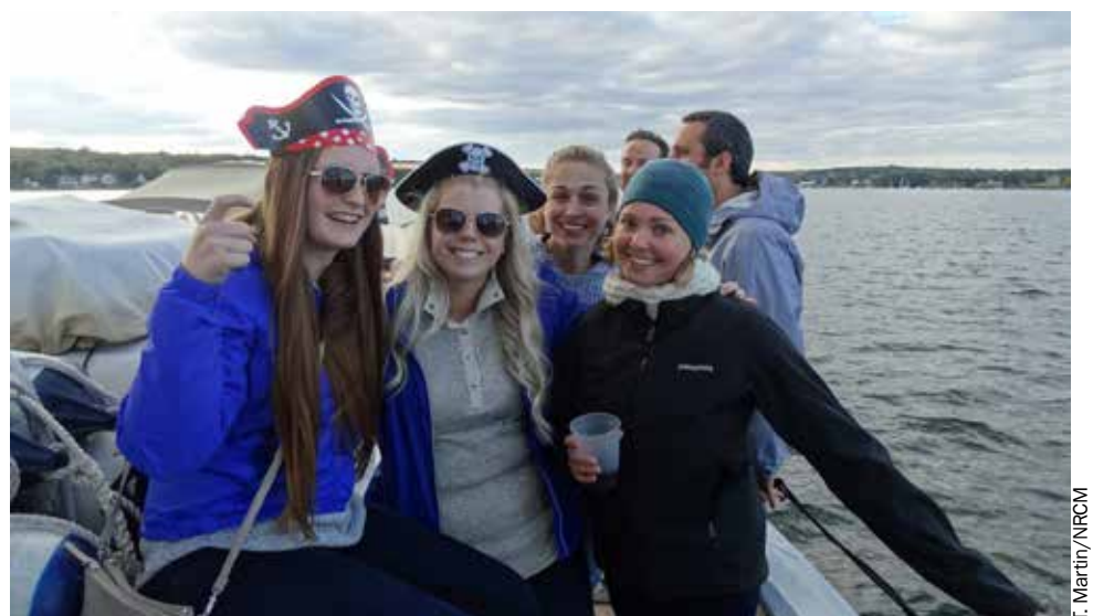
NRCM Rising sailing adventure out of Belfast.