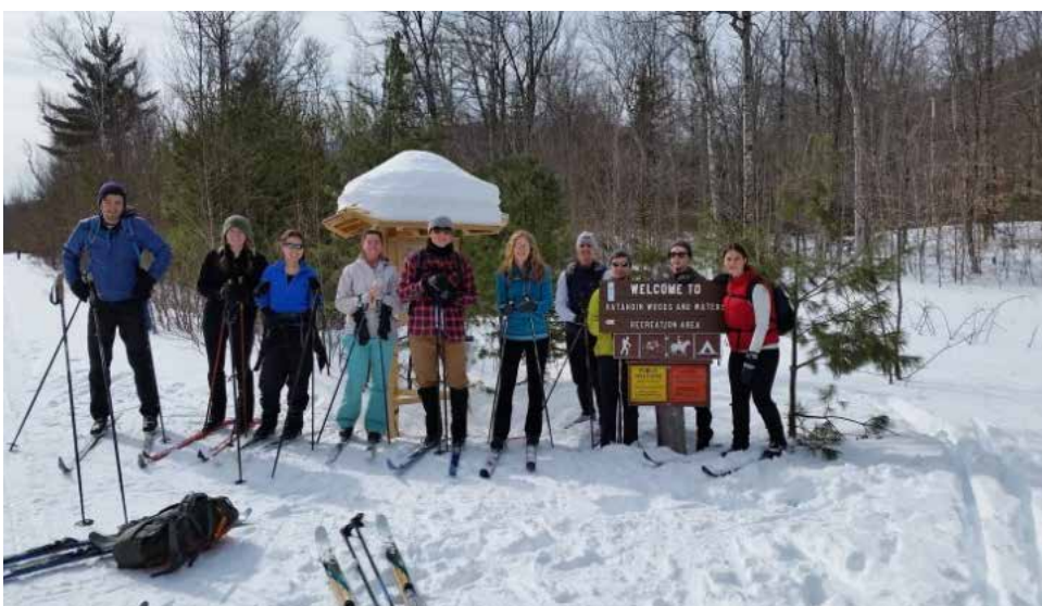
NRCM Rising cross-country ski trip to Katahdin Woods and Waters National Monument.

To know Maine is to love Maine, and when you love this place, you want to protect it for today, and for future generations, too. NRCM Rising holds events solely for the purpose of getting out into Maine's great outdoors. We host hiking, cross-country skiing, and mountain bike trips in the Katahdin Woods and Waters National Monument. We enjoy sailing adventures in Penobscot Bay and kayaking trips in Casco Bay. All of us who are fortunate enough to live here know that Maine has a tremendous sense of place. That's why connecting with Maine's lands and waters is a priority for NRCM Rising.