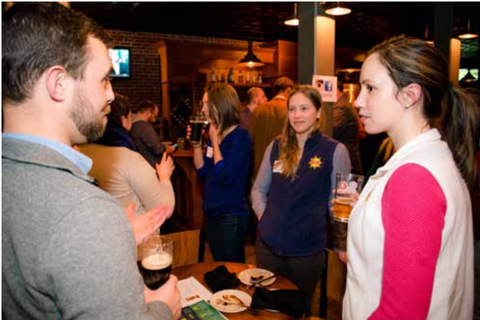
NRCM Rising members met with young legislators at a special event at Joyce's bistro in Hallowell.

Now more than ever, the future of Maine's environment depends on Mainers weighing in on environmental decisions made in Augusta and Washington, D.C. NRCM Rising helps to focus young adults in Maine on critical policies. We host Citizen Action Days at the State House, meetings where Rising members can engage with young state legislators, and special briefings on the most pressing environmental policy issues. Rising members can receive our action alerts and other information to stay up to date on when and how to contact their elected representatives. Members of NRCM Rising have testified at the State House, spoken at news conferences, written op-eds and letters to the editor on policy issues, and met with members of Maine's Congressional delegation.