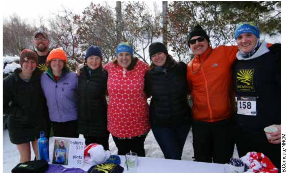
Teaming up for NRCM's Polar Bear Dip & Dash.