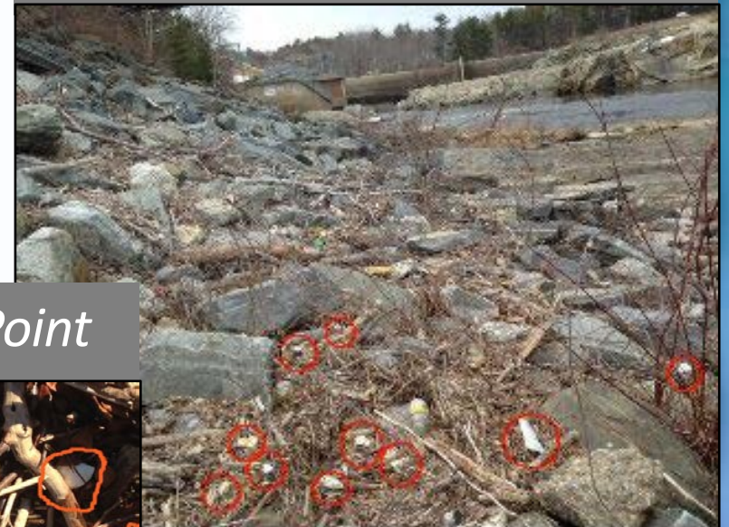
Ex. Androscoggin River