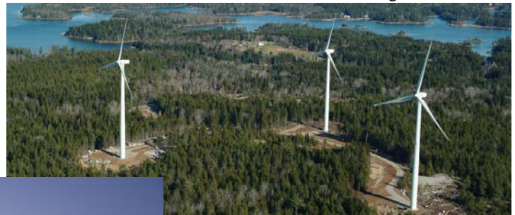
Vinalhaven Wind Farm