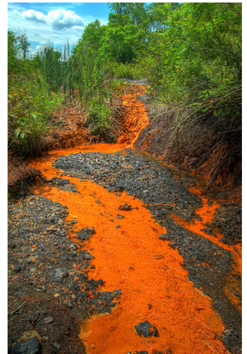
Acid mine drainage in western Pennsylvania

Background: In 2012, the Maine Legislature passed a bill to weaken Maine's mining regulations, at the request of J.D. Irving Limited, a huge Canadian conglomerate and the largest landowner in Maine. Open-pit mining refers to a type of mining where metals and other substances are removed from the earth from an open pit, as opposed to tunneling through the earth. Most of the discussion during the legislative session focused on J.D. Irving's Bald Mountain site in central Aroostook County, but there are many other places in Maine where open-pit mining could occur.