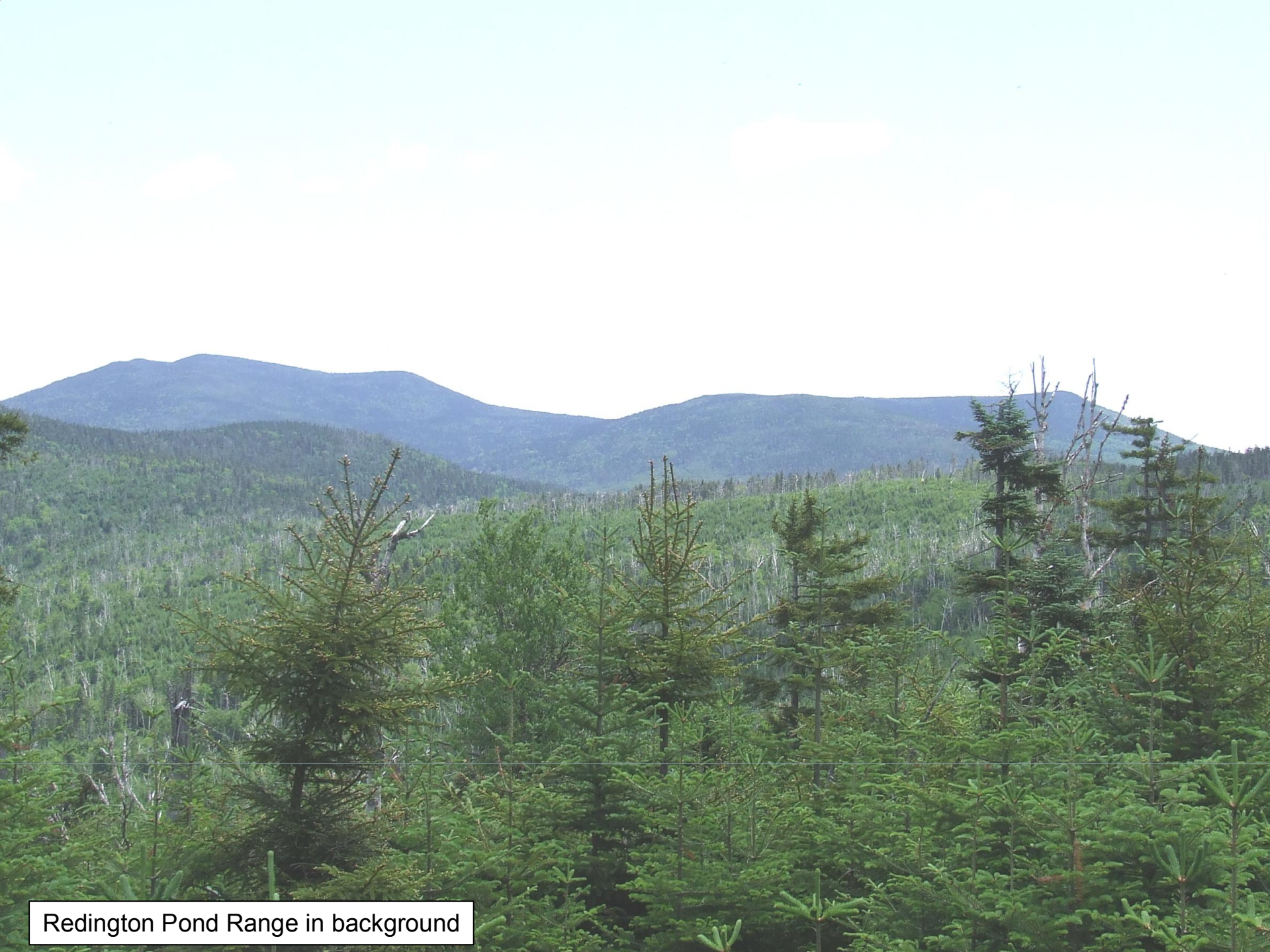
Redington Pond Range in background