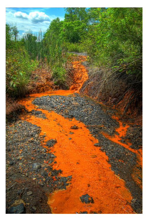
Acid mine drainage in western Pennsylvania

The Maine Geological Survey map (left) of volcanic and sedimentary rock deposits shows that very large deposits (shown in