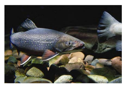
Eastern brook trout

During the 2012 legislative session debate, Irving's lobbyists promised the company would treat the contaminated water from an open-pit mine at Bald Mountain, but will they treat it for hundreds, even thousands of years? That's how long sulfide deposits can continue to produce AMD. Do Maine people want large treatment plants in the North Woods for the next thousand years? Will mining companies pay to operate such treatment plants for centuries ?