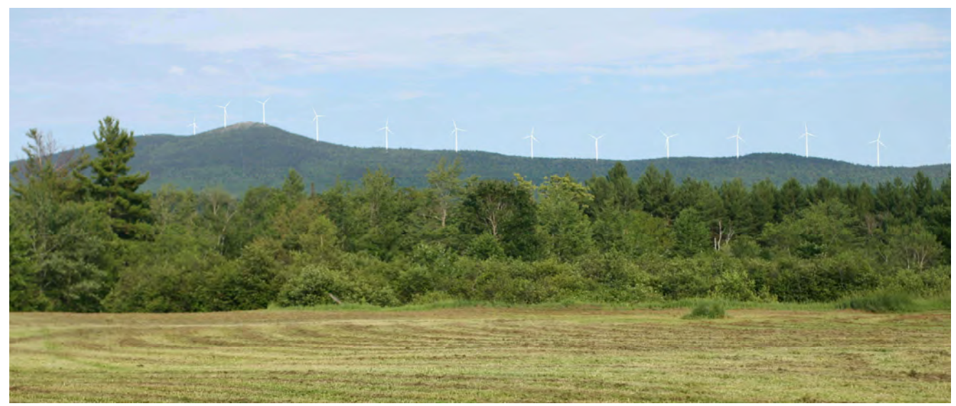
A simulated view of the Saddleback Ridge Wind project from Goodwin Road, 3.4 miles away from the closest turbine. The turbines shown on the peak at the left of the picture are on the Carthage Town Lots, which could be included in the project.

Following are visual simulations of what the wind farm would look like from Goodwin Road. One simulation includes wind turbines on the Carthage Town Lots and the other does not. The turbines shown in these simulations are GE model 1.5sle wind turbines. These same 389-foot tall units are installed at the Beaver Ridge Wind farm in Freedom, Maine, which we constructed and now operate.