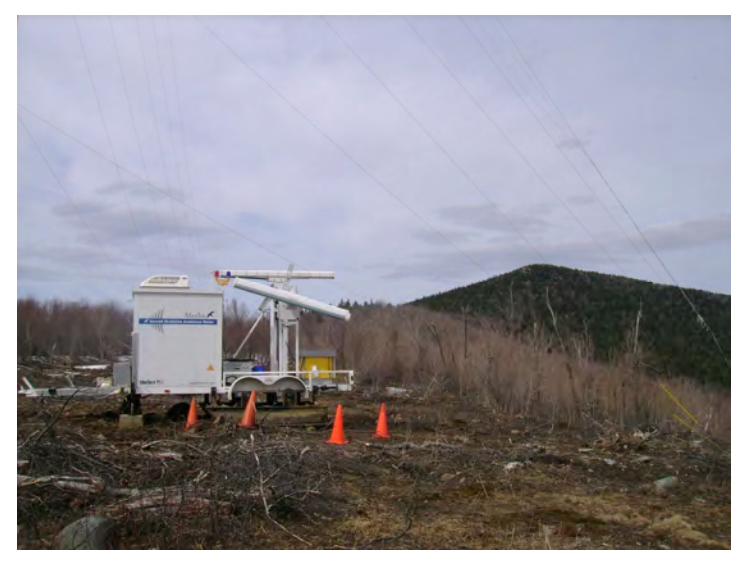
A radar unit on top of the mountain monitors migrating birds 24 hours a day for 30 days in the spring and 30 days in the fall.

Extensive surveys on resident birds (including raptors) and bats were just completed for the spring and will be done again this fall. There is also a radar unit installed on site that monitors the passage of any migrating birds. Data collected this spring indicate that the mountain is not in a migration path. Our preliminary road design is being modified to account for wetlands and vernal pools which have been located and tagged near the project area. Additional studies are underway to help us evaluate and avoid or minimize any impact to endangered or threatened flora and fauna species.