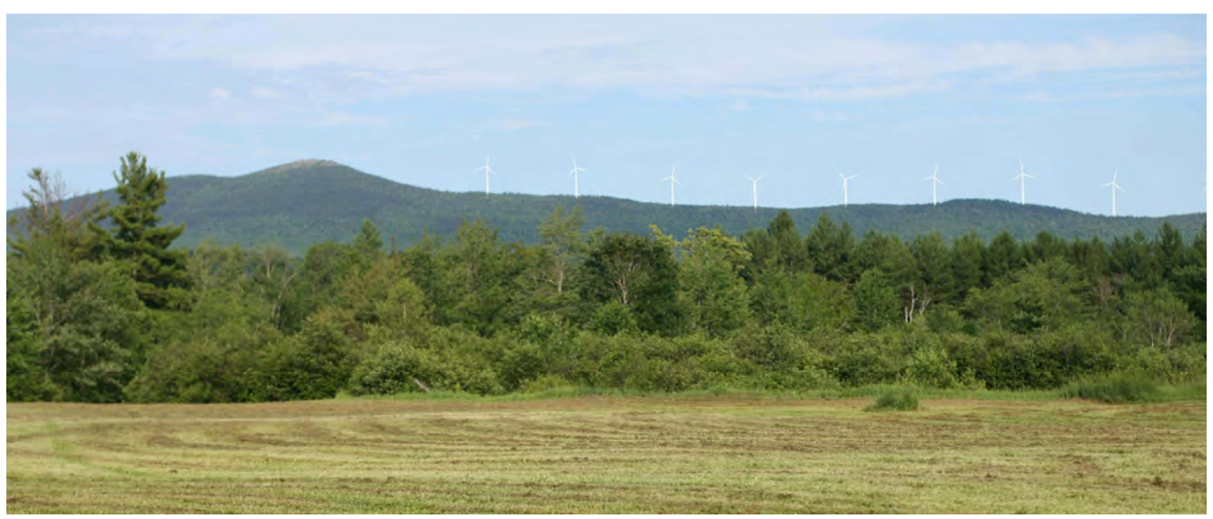
A simulated view of the Saddleback Ridge Wind project from Goodwin Road, 3.4 miles away from the closest turbine. This simulation does not include wind turbines on the Carthage Town Lots.