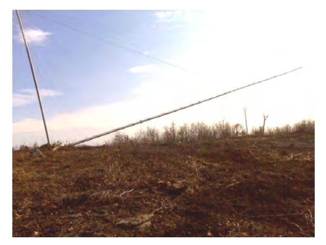
The meteorological tower on Saddleback Mountain was laid on its side and tilted upright when it was first installed.

Installing wind turbines on the Town Lots could generate approximately $10,000-$15,000 per turbine for Carthage each year. We estimate the potential for 4 - 6 wind turbines to be placed on the Town Lots, depending on the type and size of turbine used and the results of wind measurements and environmental studies currently underway. Revenues from these turbines would go directly to the Town of Carthage, and the additional turbines would raise the assessment value of the project, providing increased annual tax revenues for the town.