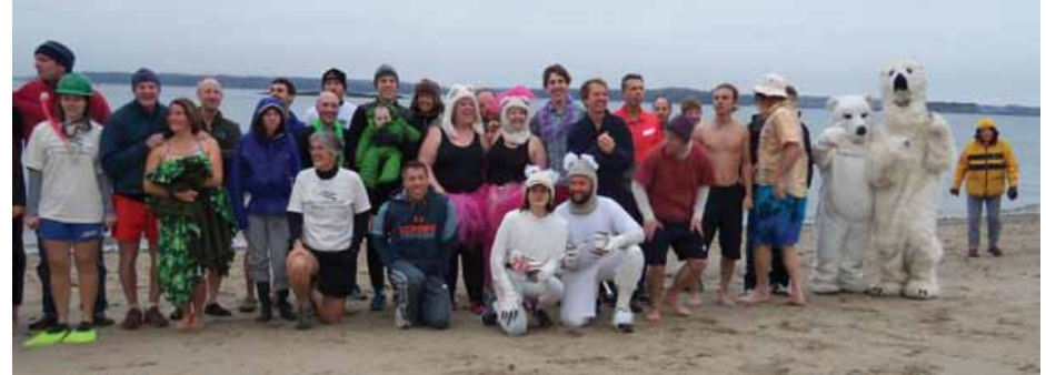
More than 100 polar dippers braved the chilly waters this year, with another 100 doing the dash!

A big "Thank you!" to all who dipped and dashed at NRCM's Polar Bear Dip & Dash December 31st. Nearly 200 people participated this year and helped us raise more than $17,500 for our clean energy and efficiency work. Congratulations to this year's winners, and thanks to all who pledged them! View winners, photos, and more online at <a href="https://www.nrcm.org/2011dipdash.asp">www.nrcm.org/2011dipdash.asp</a> and mark your calendar for this year's Dip & Dash on December 31, 2012!