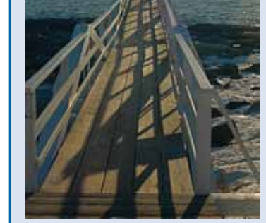
AMC's Little Lyford Pond

Send Us Your "My Maine This Week" Do you have a photograph of Maine you'd like to share? A poem? Send your submissions to beth@nrcm.org. Visit "My Maine This Week" online at www.nrcm.org.