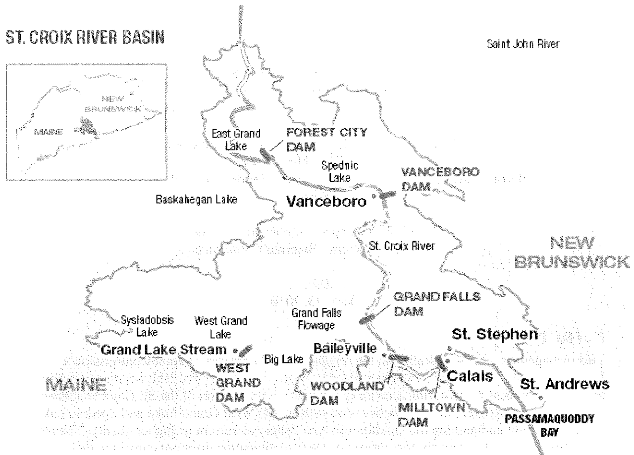
Figure 1. Map of the St. Croix watershed, with selected towns, dams, and lakes in Maine and New Brunswick identified (provided by International Joint Commission).

By the early 1980's improved fish passage and water quality in the St. Croix system resulted in an increasing alewife spawning population. This was perceived to have contributed to declining numbers of juvenile bass and poor quality smallmouth bass angling in Spednic Lake. A number of management changes were made simultaneously to address this decline, including blocking alewives from Spednic Lake beginning in 1987, which made it impossible to determine the relative impact of each action. In 1991, American and Canadian fisheries agencies began an alewife production assessment in the lower St. Croix watershed by temporarily blocking alewife passage at Grand Falls Dam. The temporary blockage was to end in 1995, however, the Maine Legislature prohibited alewife passage at the Woodland and Grand Falls fishways (12 MRSA§6134, 1995). This eliminated alewife access to over 98% of the species' projected St. Croix spawning habitat (Anonymous 1993). The stock declined from 2.6 million returning alewives in 1987 to only 900 in 2002 (St. Croix International Waterway Commission 2009). When efforts to change Maine's 1995 St. Croix alewife blockage law failed in 2001, Department of Fisheries and Oceans, Canada (DFO) began trucking a portion of the river's alewife run around the Woodland Dam.